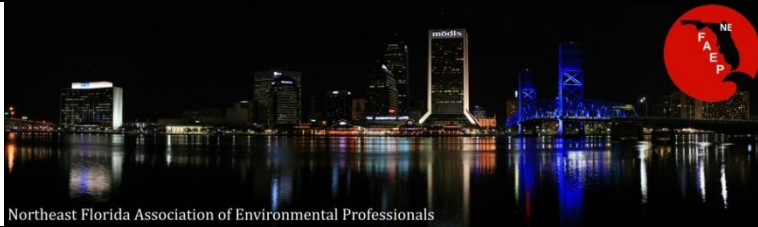
Northeast Florida Association of Environmental Professionals